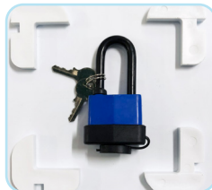
Safety lock, keys and accessories