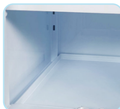
25mm adjustable PP tray