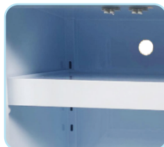
Adjustable shelf with secondary sump