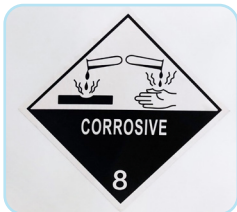
Clearly labeled CORROSIVES

WORKSafe® PP Cabinet For Acid And Corrosive, 19 Gal Custom-Made A Separate Poly Tray with Secondary Sump Add Castors and Anti Corrosive Safety Lock