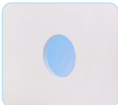
2-inch back vent