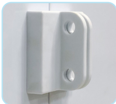
Accepts padlock for added security